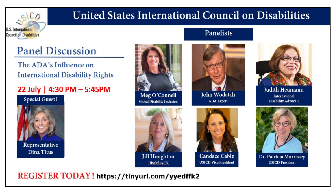
The ADA's Influence on International Disability Rights Event Flyer