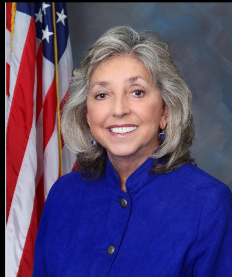
Representative Dina Titus (D-NV)