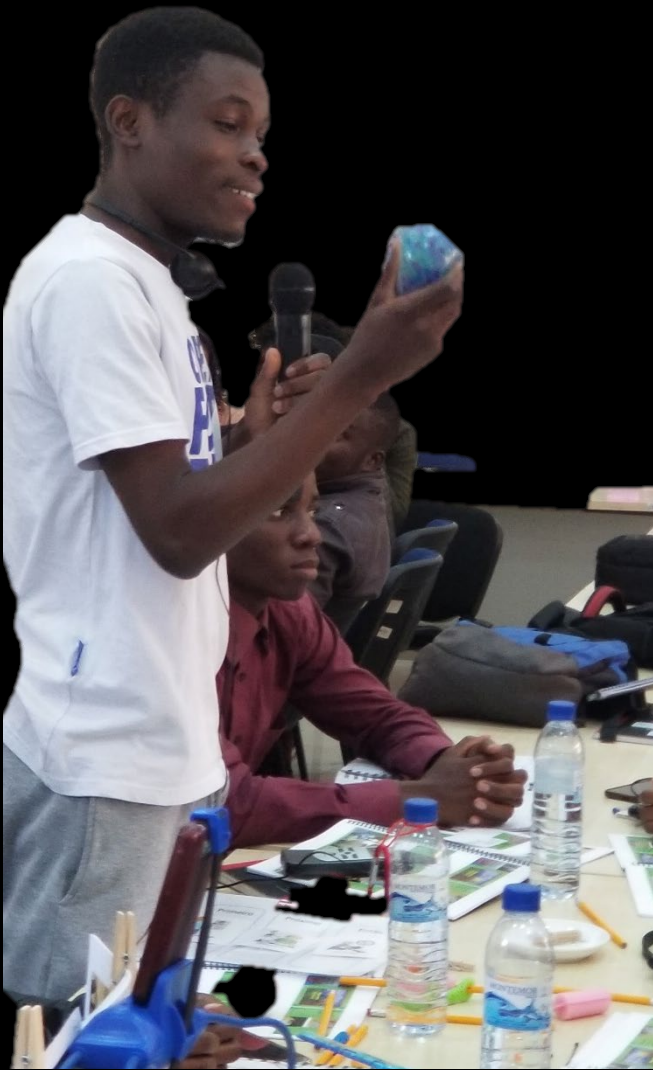
Maputo Mozambique Inclusive Education Advocacy Training Participant