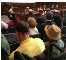
Attendee uses U.S. innovation to participate in CRPD briefing by American business leaders