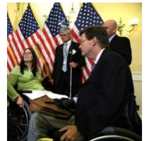
VSO Press Conference on CRPD